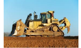
River Levee Crown