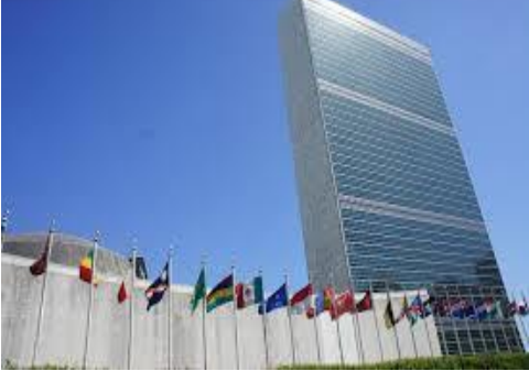
New York City – United Nations

Vietnam Indonesia Burma Malaysia Thailand Philippines India Brunei Bangladesh Timor Leste